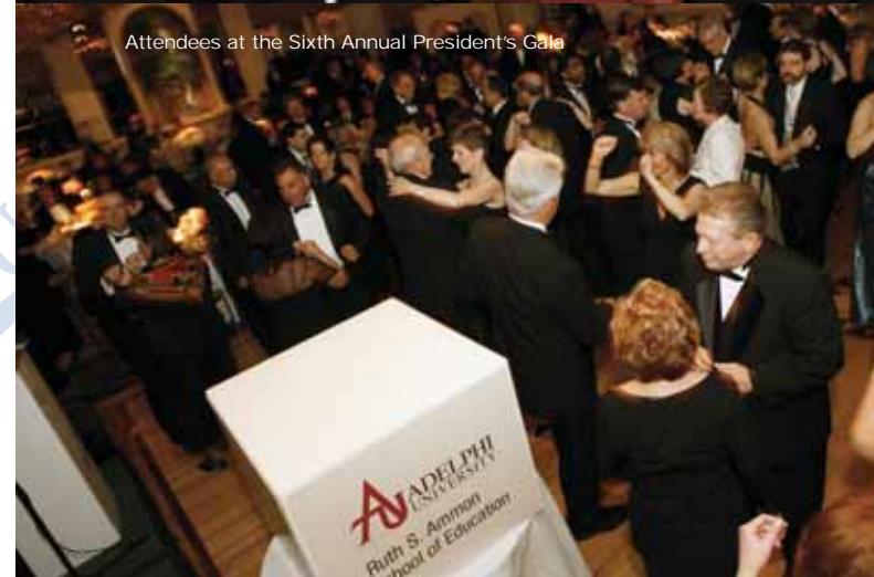
Attendees at the Sixth Annual President's Gala