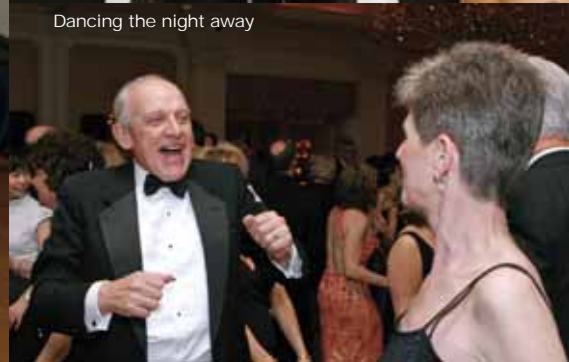
Dancing the night away