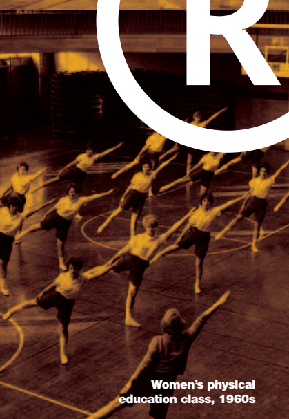
Women's physical education class, 1960s