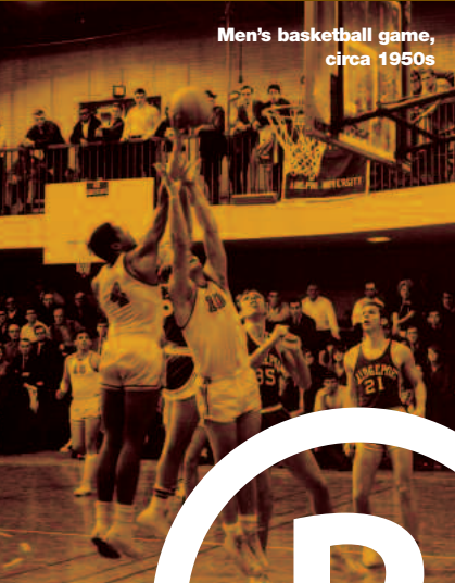
Men's basketball game, circa 1950s