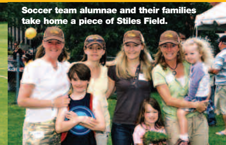
Soccer team alumnae and their families take home a piece of Stiles Field.

Since that time, eight varsity teams have taken to the field, producing countless victories and lasting memories. The field was also used for graduation ceremonies from the mid-1980s through 2004, and has been the site of Adelphi's annual homecoming festivities.