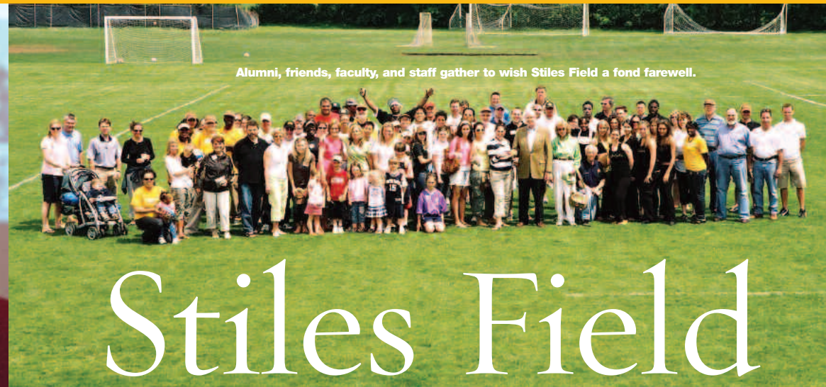
Alumni, friends, faculty, and staff gather to wish Stiles Field a fond farewell.