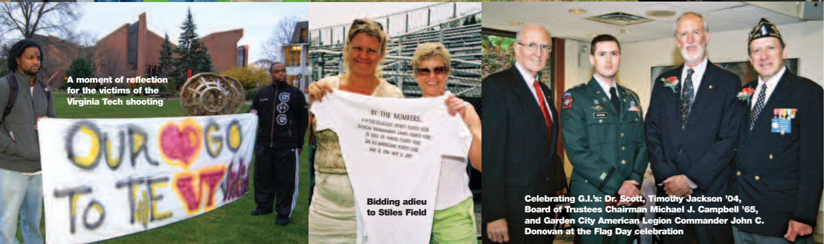
A moment of reflection for the victims of the Virginia Tech shooting